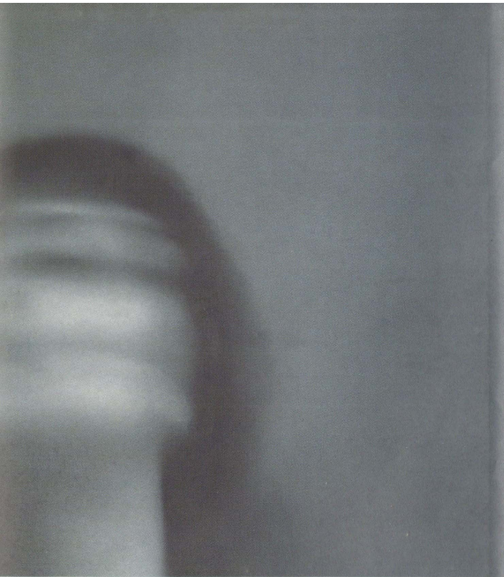
Cover photograph and design by Pinaki De

Published by The Registrar, Netaji Subhas Open University, DD 26, Sector 1, Salt Lake, Kolkata - 700064.